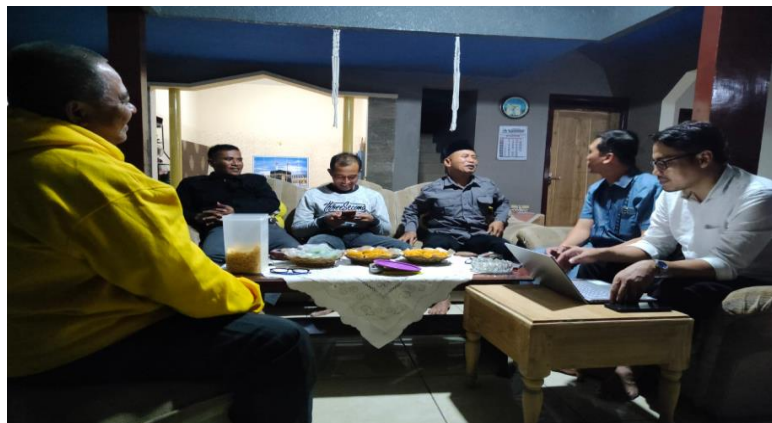
Figure 4. Audience With Administrators Bumdes and Government Village

Activity accompaniment Phase I is implemented through FGD with administrator BUMDes, devices village, and BPD. On mentoring This formulated draft document BUMDes Articles of Association (AD). Sumberejo through pre-events Village Deliberation (MUSDES). I am following This documentation activity accompaniment stage I.