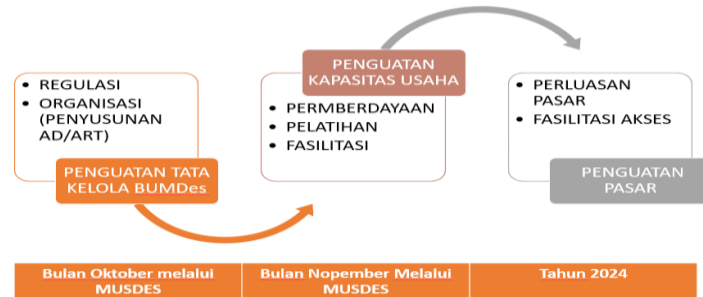
Figure 3. Stages accompaniment BUMDes Sumberejo

Activity accompaniment Phase I is implemented through FGD with administrator BUMDes, devices village, and BPD. On mentoring This formulated draft document BUMDes Articles of Association (AD). Sumberejo through pre-events Village Deliberation (MUSDES). I am following This documentation activity accompaniment stage I.