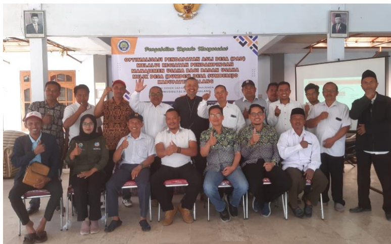
Figure 6. Group Photo of Participants And Presenters

Training management BUMDes carried out by the PKM FEB UM Team with participants consisting of from government villages, institutions self-subsistent community, and administrators BUMDes. Activity second assistance is training to analyze the strengths and potential development business in BUMDes. The results of the assistance provided are that BUMDes formulate development ideas business has reached a stage compile plan business. Accompaniment management BUMDes is very helpful to public villages in operating business BUMDes, starting from planning, and implementation, up to evaluation