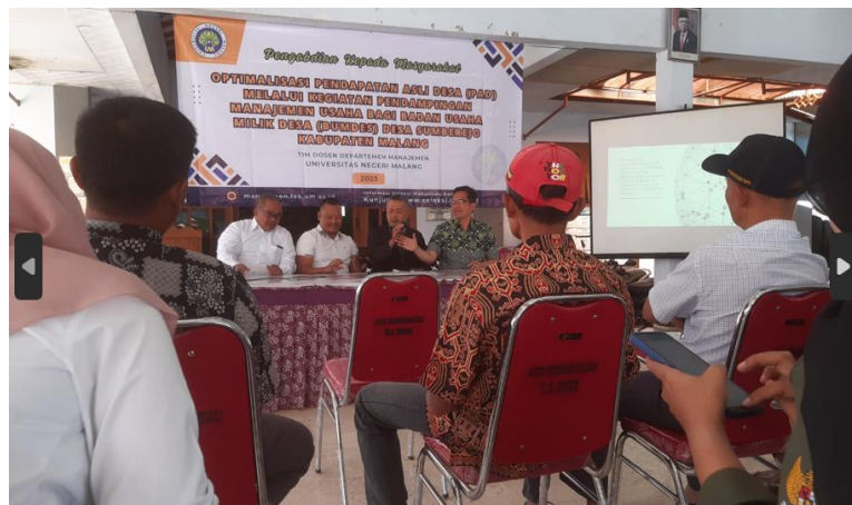
Figure 5. Entire Participant Accompaniment Development BUMDes

Whereas activity accompaniment stage two is implemented by involving MUSDES events head village along with the apparatus.