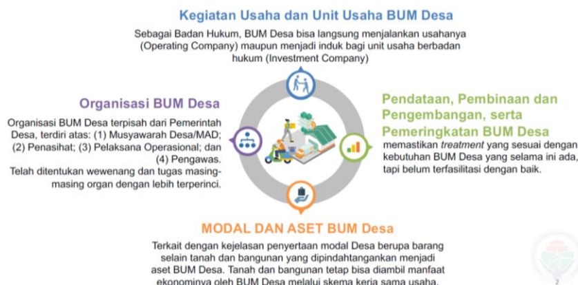
Figure 2. Reinforcement BUMDes Regulation Government Number 11 of 2021

Activity This training and mentoring begin with an audience in frame analyzing condition BUMDes and the potential development economy village Sumberejo. Results of hearings with the government village and administrators BUMDes get results that.