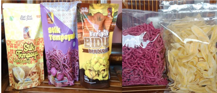
Figure 1. Partner Products